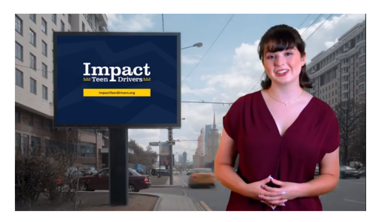
Speak Up, Save a Life Positive Peer Videos